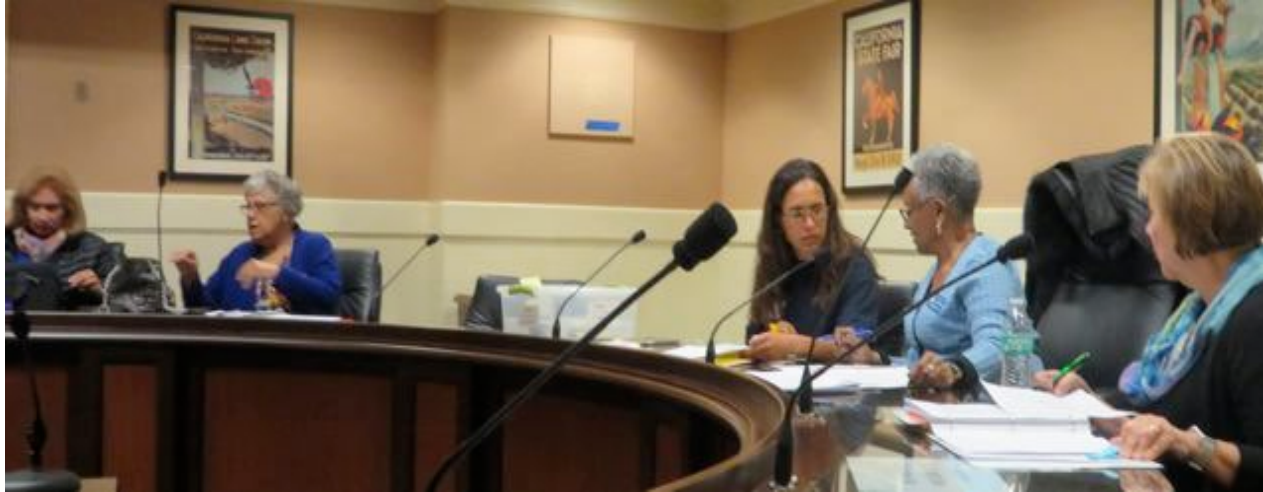
Policy Committee Hearing—State and Local Government