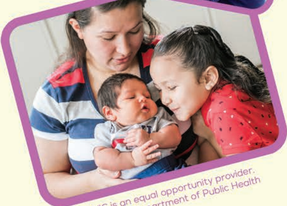
WIC is an equal opportunity provider. California Department of Public Health